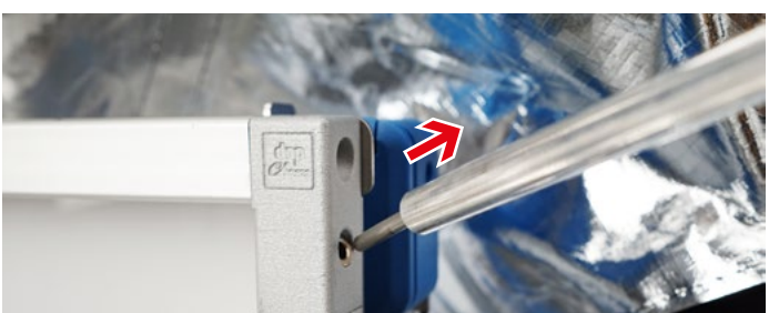
3.) Pull out the rod ends on the RABBIT-EARS® – start with the lower ones first.