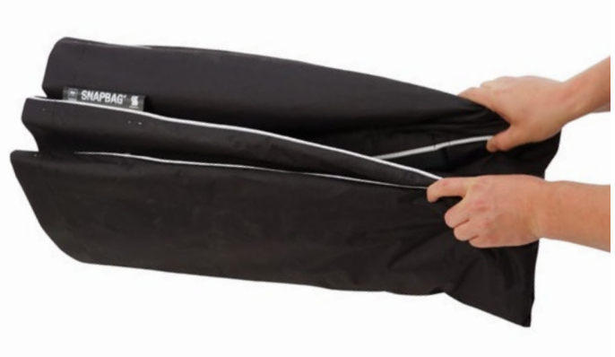
7.) Put the SNAPBAG® back into the designated transportation bag.