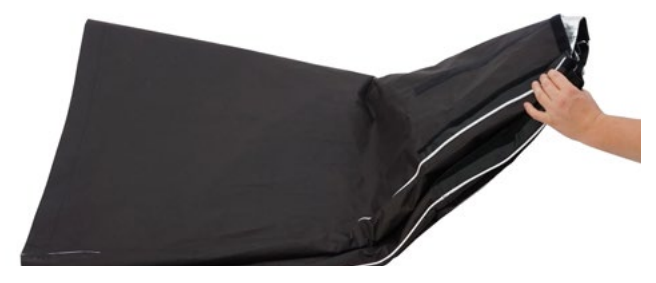
5.) Fold the SNAPBAG® together as shown in the picture.