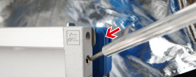
4.) Push in the 2 upper rods first to the RABBIT-EARS® – continue with all other rods.