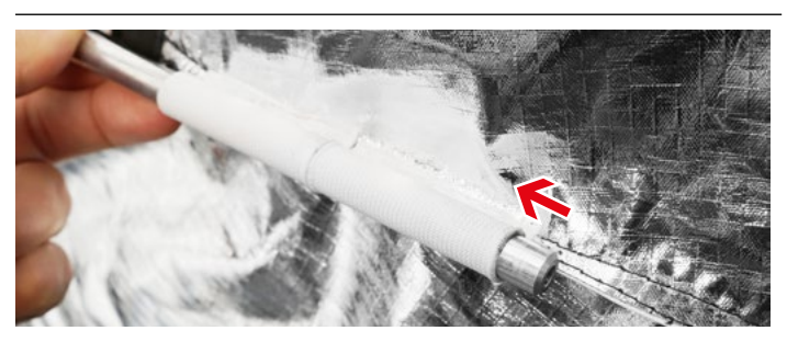
4.) Release the rod extensions and pull them back to the very end of the white elastics.