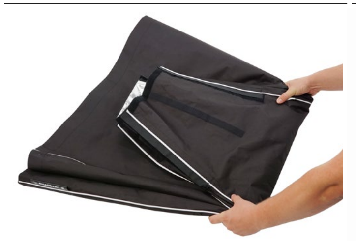
6.) Important: the rod extensions must be pulled back to the very end in order to fold the SNAPBAG® as shown in the picture!