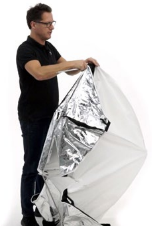
3.) Open the Lantern fully