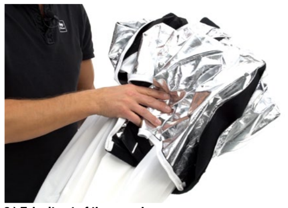
2.) Take it out of the carry bag: There are 8 Pole extensions that need to connected to the thin poles