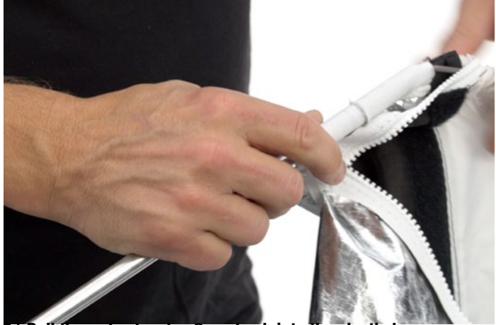
5.) Pull the rod extension 2 cm back into the elastic loop