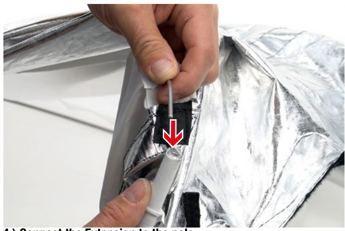
4.) Connect the Extension to the pole