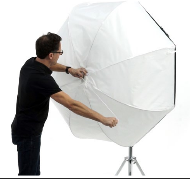
8.) Use the white elastic strap to bring the Lantern in your preferred shape.

To unmounts the Lantern 5 take care that you