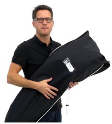
1.) We have packed the Lantern5 very compactly. To install it the first time please follow these instructions

OPERATING INSTRUCTIONS – BEDIENUNGSANLEITUNG