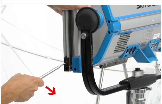
5.) It helps if you gently push the rods to the back of the housing so they slide easily into the Rabbit Ears insert hole.