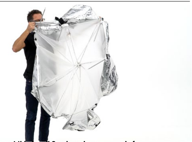
6.) Repeat this for all 8 rods and you are ready for the first basic setup

Important: Please follow the general instructions how to set up the Lantern 5