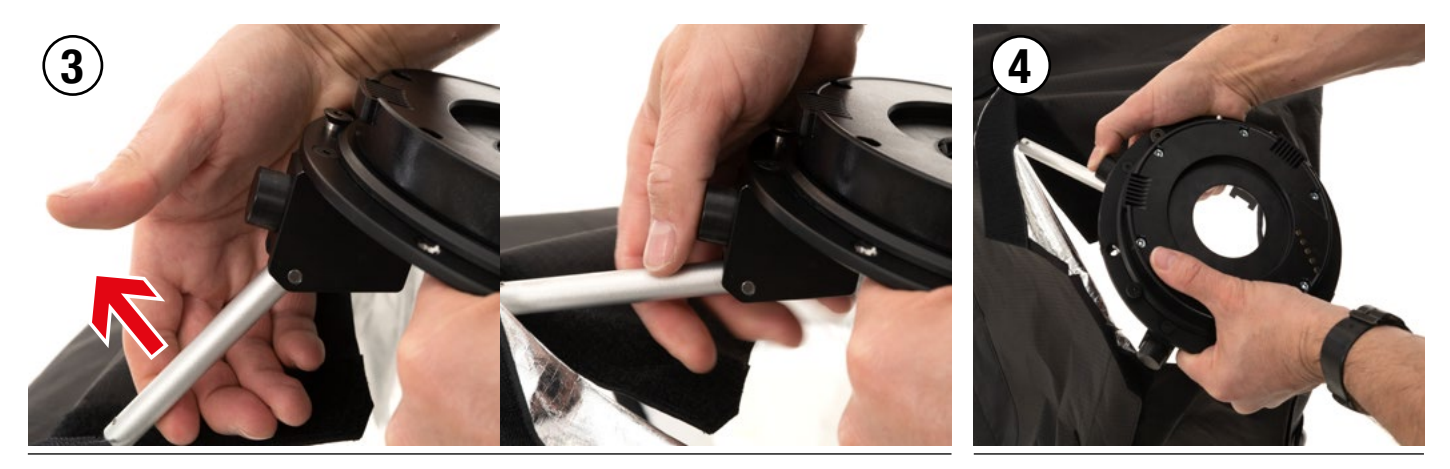
SNAPBAG instructions: Unfold the SNAPBAG by pulling up the metal rods as shown in picture 3. The metal rods will click into place at the mechanical stop. In order to fold up the SNAPBAG please push the release buttons as shown in picture 4.

DOME instructions: Put the DOME on an even surface and push it down as shown in picture 1. By pushing the DOME down, the internal steel-stirrup approaches the two metal hooks as shown in picture 2. Make sure the steel-stirrup slides into the two hooks. In order to fold up the DOME, please push it down again and slide the steel-stirrup out of the two metal hooks.