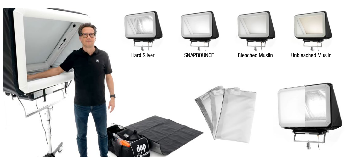
READY TO GO! You can now add other reflective backgrounds and fronts to the Airglow

Close the buckles and loop the elastics over the fixture to prevent spray light.